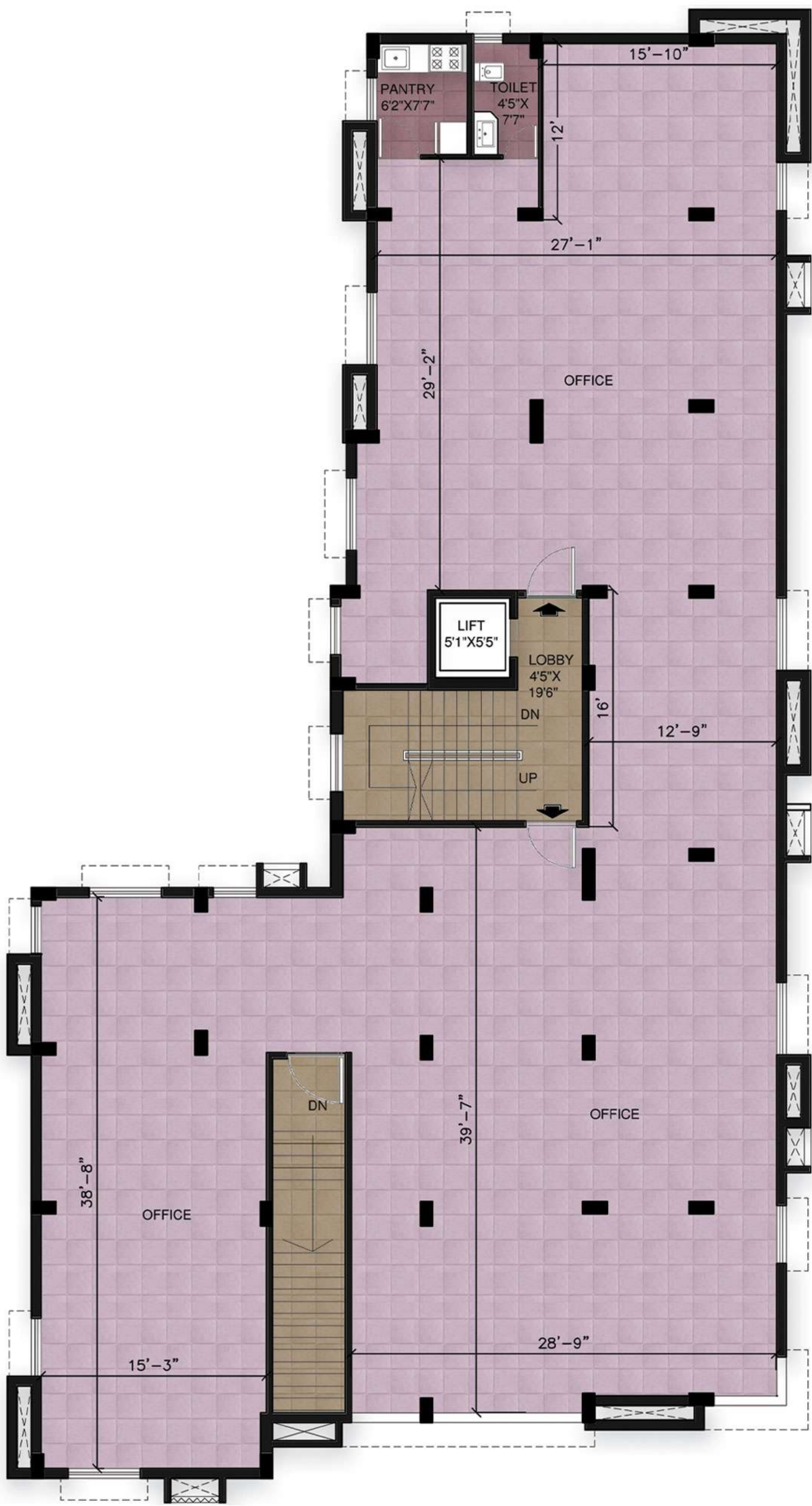
COMMERCIAL FLOOR PLAN