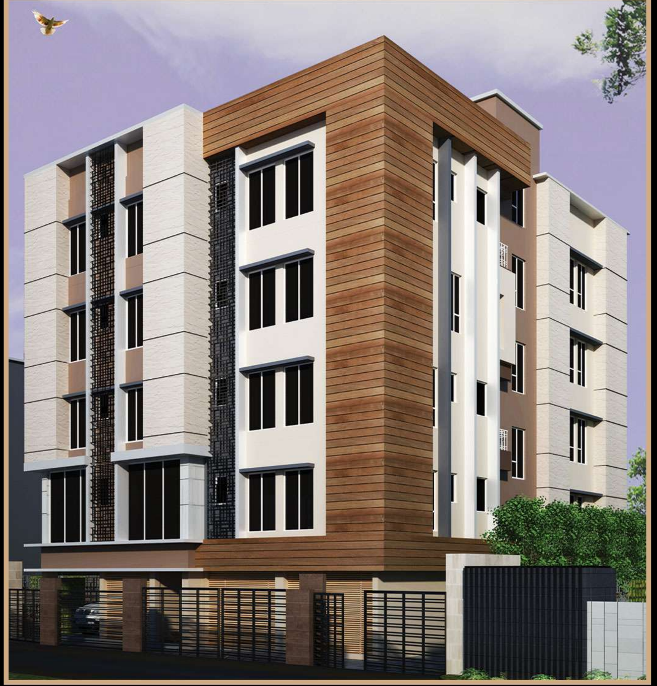
192A, HARISH MUKHERJEE ROAD