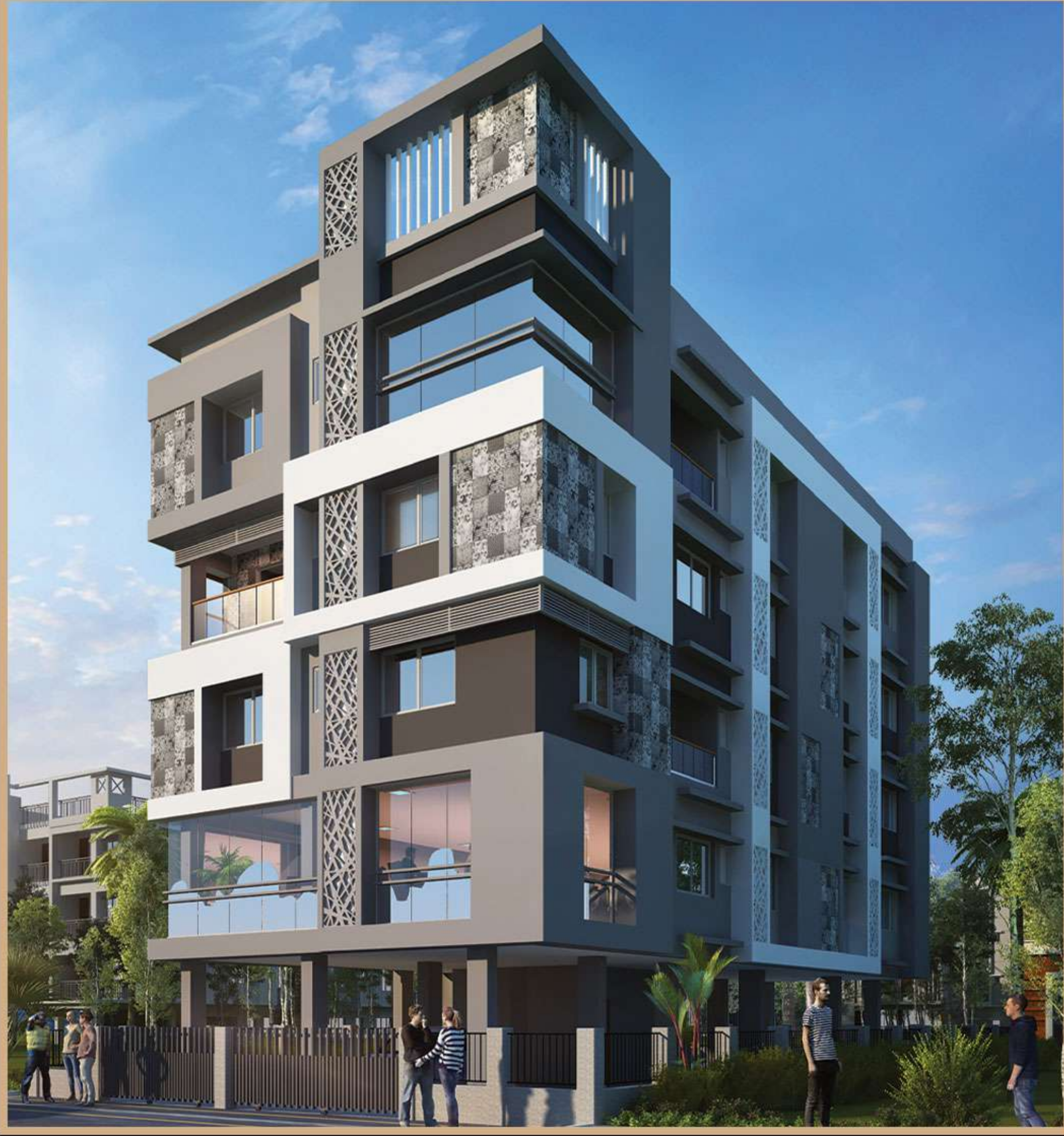
44, LAKE TEMPLE ROAD