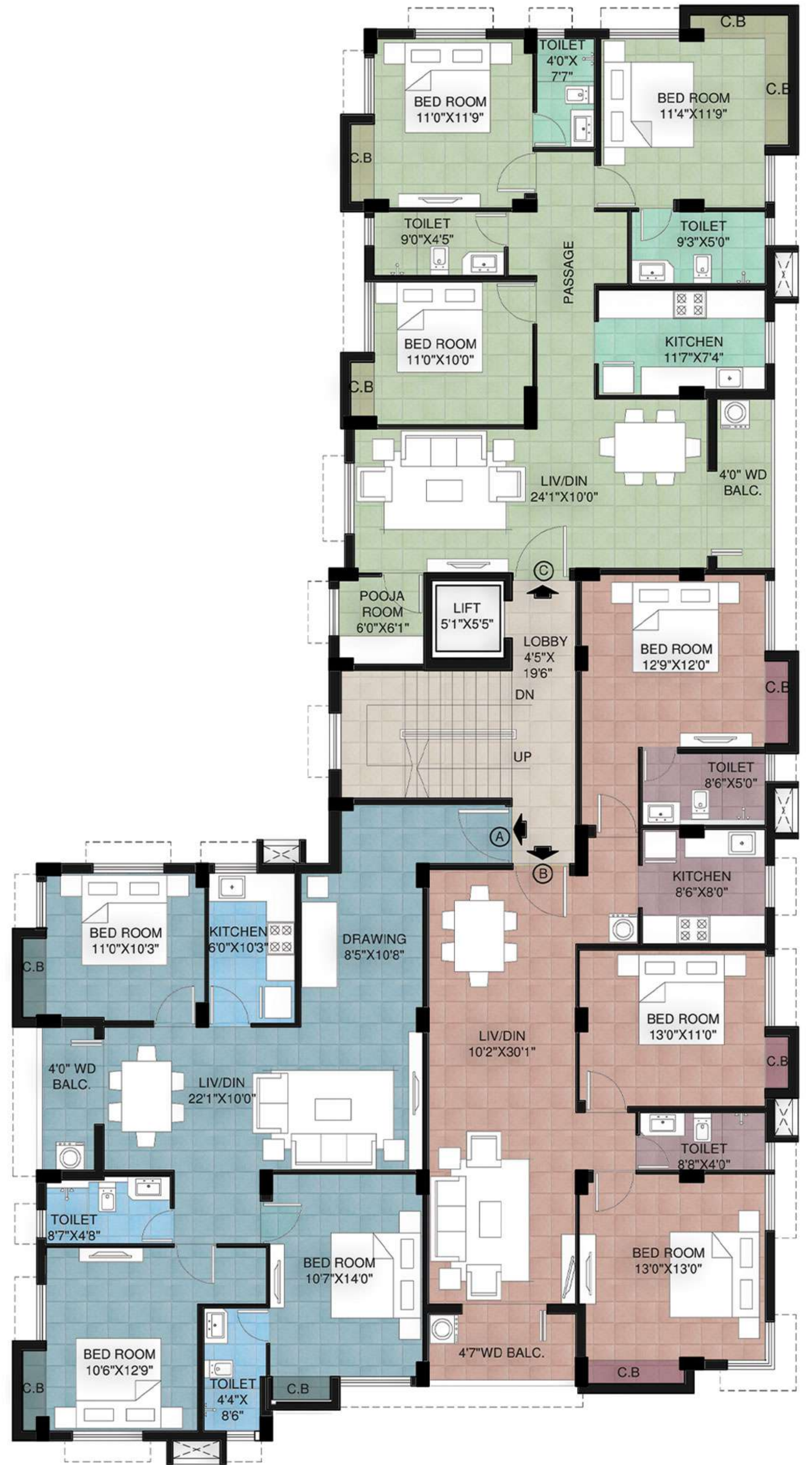
RESIDENTIAL FLOOR PLAN