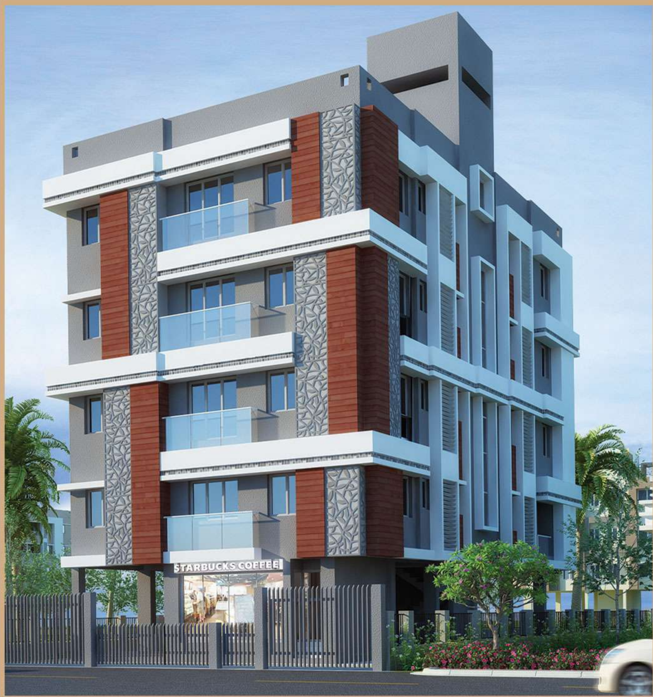
55, SOUTHEND PARK